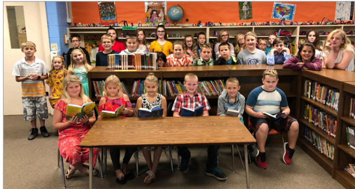
Bennett upper elementary students enjoy new books thanks to grants.

F&B, the local telecommunications provider in Bennett, is